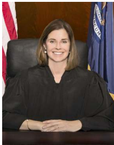
Hon. Bridget M. McCormack Michigan Supreme Court Email